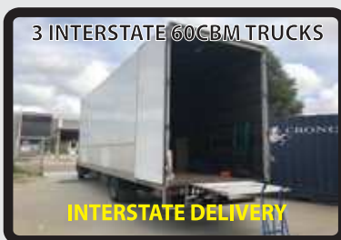
3 INTERSTATE 60CBM TRUCKS