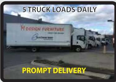
5 TRUCK LOADS DAILY

Product value is important to our customers, and because of this it is important to us. Our sales team is constantly monitoring market trends and thrive on exceeding customer expectations. Our level of quality and service, intricate product value and design is what has helped make M Design Furniture a genuine market leader.