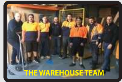
THE WAREHOUSE TEAM