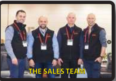
THE SALES TEAM