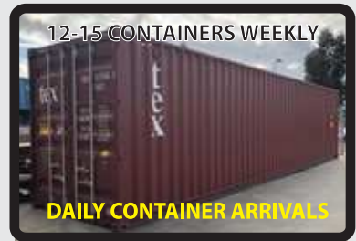
12-15 CONTAINERS WEEKLY